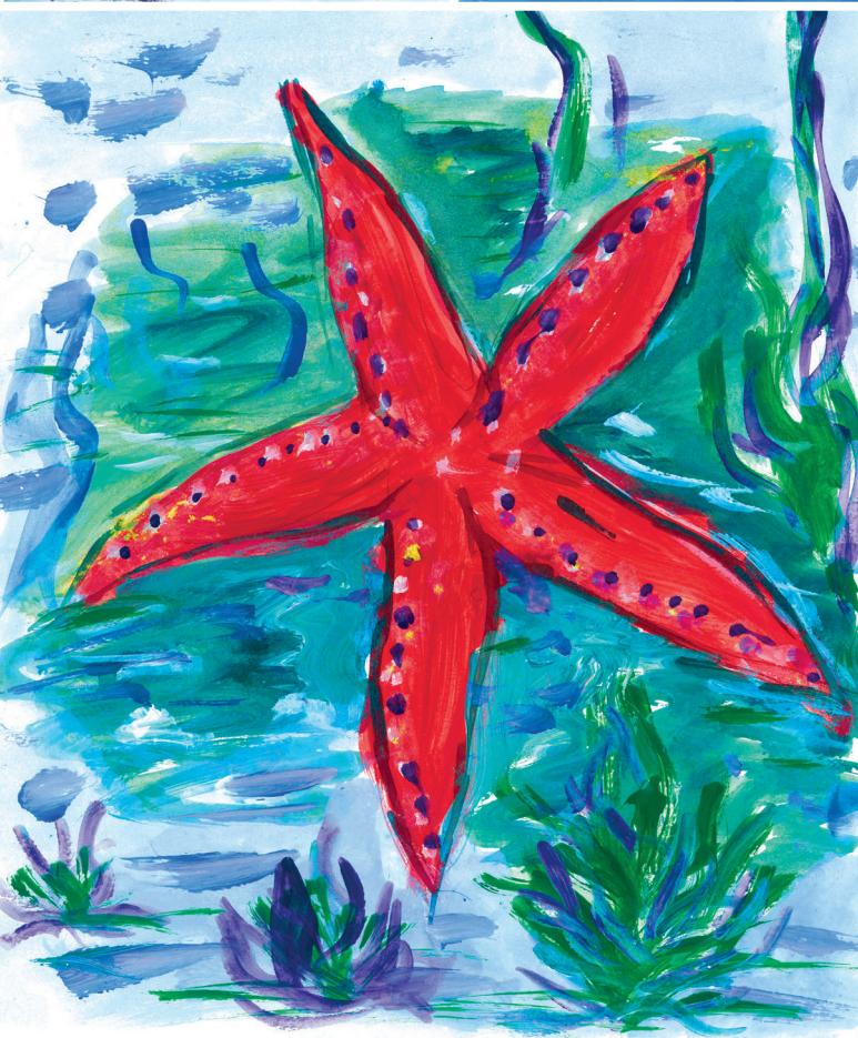
Radovi djece iz Doma za odgoj djece i mladeži Zadar (simbol: morska zvijezda)